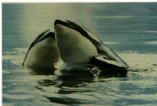
Two friends: Johnstone Strait.

This could be one reason they are both able to inhabit the same area. They use different resources and don't compete with one another.