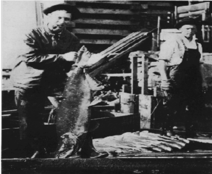
Salmon of this size were common in most west coast ports until the 1950