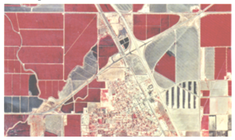
Landsat color-infrared composite - Williams, California quadrangle

For more technical information you might consult the Manual of Remote Sensing, published by the American Society of Photogrammetry and Remote Sensing, 5410 Grosvenor Lane, Bethesda, MD 20814-2160.