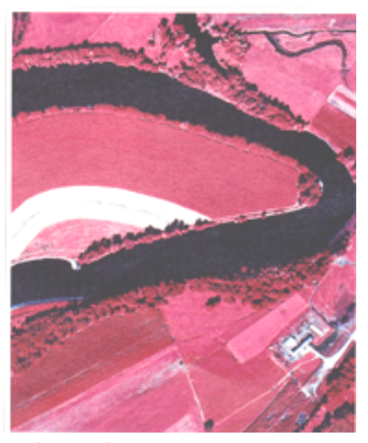
Color-infrared photo - same area

Each layer is sensitive to different wavelengths of energy. Standard-color film emulsions normally record the visible wavelengths as red, green, and blue. After recording the scene ("taking the picture"), chemical processing of the film generates cyan, magenta, and yellow dyes proportional to the amount of exposure given each layer. Color pictures result when the human eye views the varying combinations of the three dye layers. Color-infrared film has yellow filter over the three emulsion layers to block ultraviolet (UV) and blue