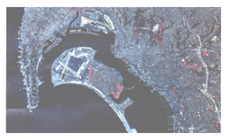
NASA color-infrared photo - San Diego, California