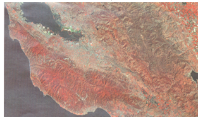
Landsat color-infrared composite - San Francisco, California

Another type of color-infrared image is the color-infrared composite of multispectral data collected by electronic sensors on satellites such as Landsat. These sensors record the light levels of Earth's reflected energy (visible and near-infrared) and transmit digital image data to the ground in four to seven wavelength bands (groups) for each typical Landsat scene.