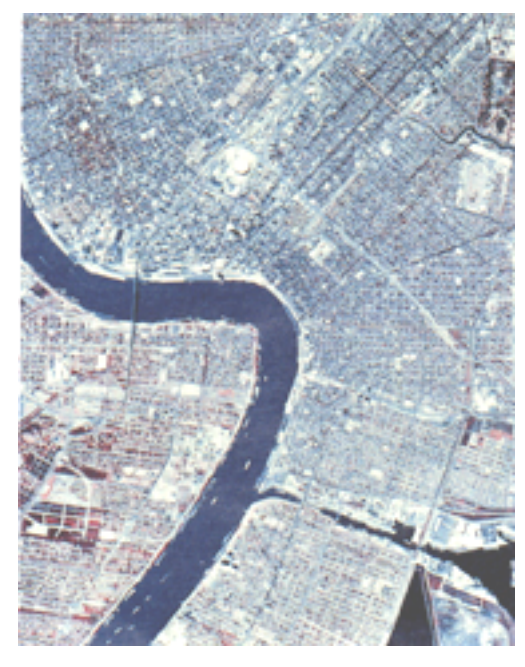
U.S. Department of the Interior U.S. Geological Survey

NASA color infra-red photo - New Orleans, LA