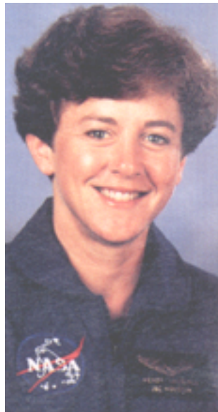
Wendy Lawrence, astronaut and oceanographer.

As Space Shuttle astronauts circle the globe, most of them find other things to do than look out the window during long intervals over the ocean. Not Wendy Lawrence, who earned a master's degree in ocean engineering in a program run by WHOI and MIT. She kept her face pressed to the window during ocean fly-overs, in spite of the teasing she sometimes got from her fellow astronauts, whom she points out, "were all astronomers!"