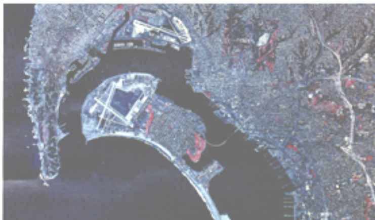
NASA color-infrared photo - San Diego, California