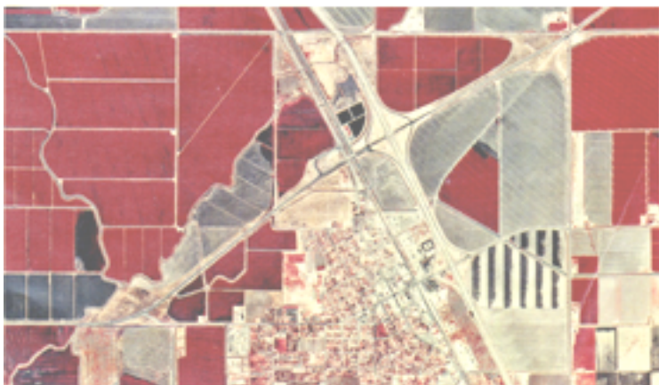
Landsat color-infrared composite - Williams, California quadrangle

For more technical information you might consult the Manual of Remote Sensing , published by the American Society of Photogrammetry and Remote Sensing, 5410 Grosvenor Lane, Bethesda, MD 20814-2160.