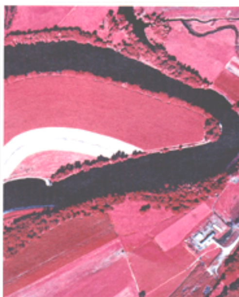
Color-infrared photo - same area

Each layer is sensitive to different wavelengths of energy. Standard-color film emulsions normally record the visible wavelengths as red, green, and blue. After recording the scene ("taking the picture"), chemical processing of the film generates cyan, magenta, and yellow dyes proportional to the amount of exposure given each layer. Color pictures result when the human eye views the varying combinations of the three dye layers. Color-infrared film has yellow filter over the three emulsion layers to block ultraviolet (UV) and blue