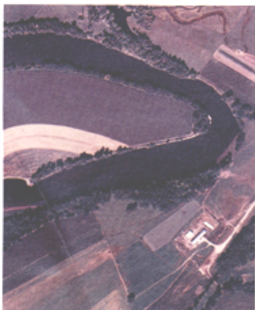
Color photo - near Burlington, Vt.

Both standard-color and color-infrared films are manufactured to have three distinct layer or emulsions.