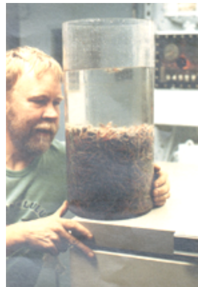
Biologist Carl Wirsen and shrimp collected from the TAG mound.

The more complex animals live off the chemosynthetic vent bacteria that grow at "warm" temperatures, either eating them directly or harboring them in their bodies and living off the organic compounds the bacteria produce.