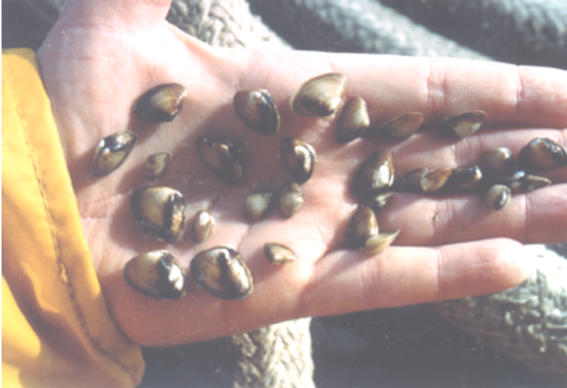
Asian clams from San Francisco Bay - March 1993