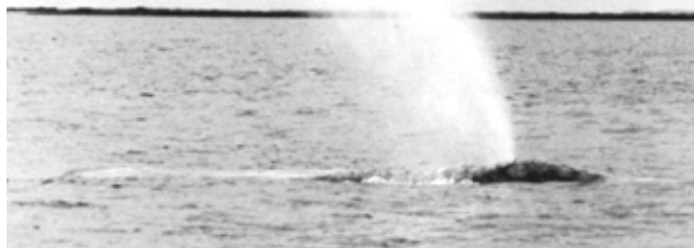
Gray whale spout (side view)