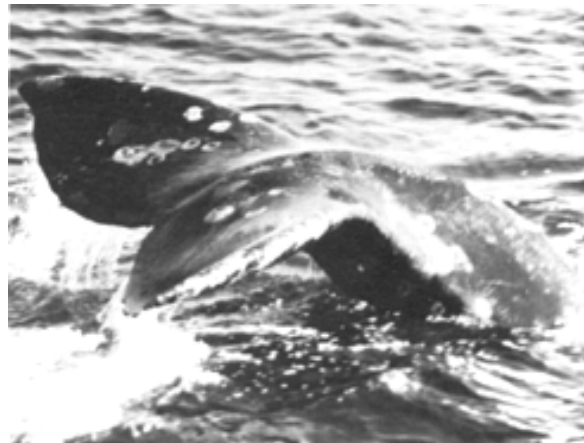
The gray whale's powerful fluke drives the whale forward with each undulation