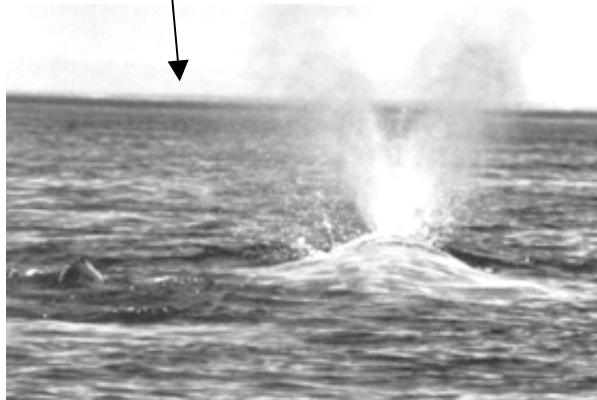
Gray whale spout (view from behind)