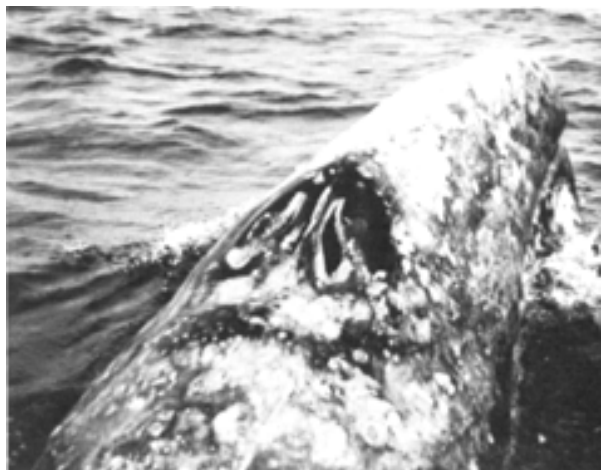
Gray whale nostrils open for exhalation