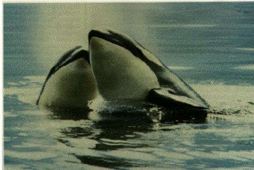
Two friends: Johnstone Strait.

This could be one reason they are both able to inhabit the same area. They use different resources and don't compete with one another.