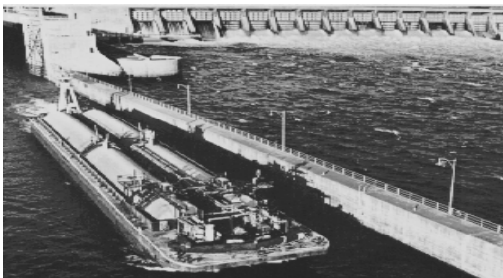
Dams on the Columbia River have provided cheap hydroelectric power and attracted industry. However, they have also created problems for the salmon industry.

Its physical character began to change dramatically during the late 1800's. Farmers were attracted to the river's broad flood plain by the rich black soil. The problem was that much of the flood plain was part of the estuary and, at least during high tide, was submerged. By the 1930's farmers had "solved" that problem, or so it seemed. Two-thirds of the estuary was diked and drained. At first the land was productive. Dairy herds sprang up throughout what was once fish and wildlife habitat. But the good times did not last. Within a few short decades, the land began to subside. While farming contributed substantially to the culture and economy of the region for a short time, the land was not suited to agriculture and it began to fail. Land which once supported a herd of dairy cows soon supported only a few animals. The first tragedy of the estuary was becoming apparent: the drained acreage was no longer useful as wildlife habitat and was rapidly losing its value as farmland too. Much of it now lies fallow.