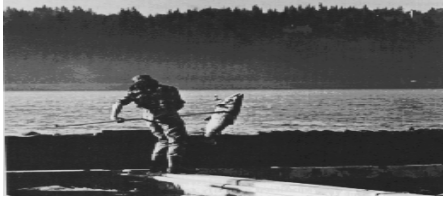
An employee of the Little White Salmon Hatchery removes a dead salmon from a raceway. The dams, water diversion, and contamination have adversely affected the salmon fishery.

These environmental changes have caused economic and cultural hardships for some people, while others seem to have prospered, or at least survived. An entire era of human use of the lower river ended last month when the last of the great Columbia River salmon canneries closed in Astoria.