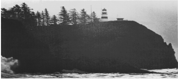
Cape Disappointment. The mouth of the Columbia River is world-famous for its storms and rough seas.

At Cape Disappointment in the extreme northwest corner of Oregon, where one of the great rivers of the world slows down, sprawls out, and spills into the sea, lies the Columbia River estuary, 150 square miles of tidal marshes, mud flats, and shallow brackish water.