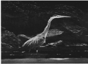
The Great Blue Heron is one of the many hundreds of thousands of birds which depend upon the lower Columbia River estuary for survival.

From the time it cascades out of the high Rocky Mountains until it reaches the Pacific, the Columbia's water will be used and reused; coveted, diverted and contaminated; heated, treated, and mistreated. And yet, its use has influenced all of our lives.